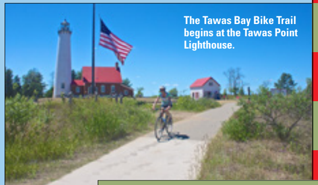
The Tawas Bay Bike Trail begins at the Tawas Point Lighthouse.