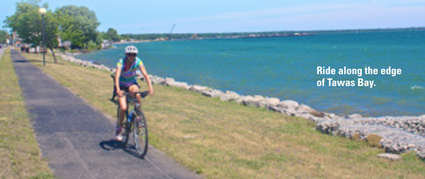
Ride along the edge of Tawas Bay.

The newest section, from Alabaster Road to Dyer Road, was completed in 2015. It travels along an abandoned rail line and through the remnants of an abandoned gypsum mine and shipping port (gypsum mining is still active elsewhere in Alabaster Township). This area is one of the most scenic parts of the trail with nice views of the bay and the abandoned offshore loading facility (a popular tourist attraction). The trail ends at the Dyer Road trailhead, where you can take your picture next to a big boulder-size chunk of gypsum. In case you're curious, the highest grade of fine-grained gypsum is known as "alabaster."