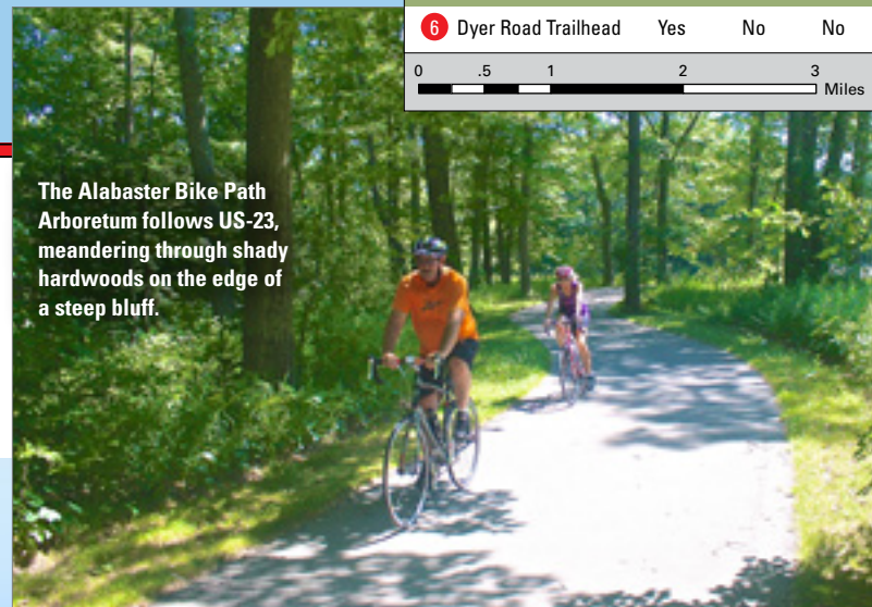
The Alabaster Bike Path Arboretum follows US-23, meandering through shady hardwoods on the edge of a steep bluff.

©2017 Rockford Advertising. All rights reserved.