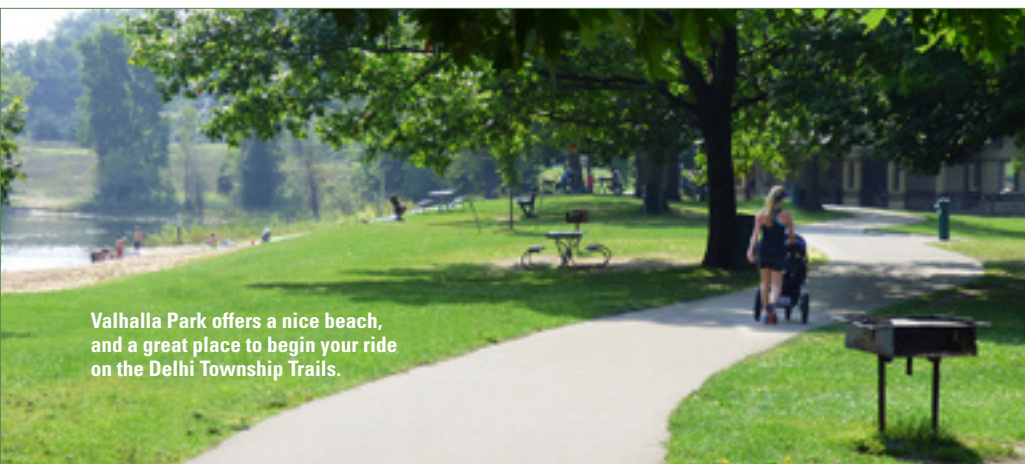
Valhalla Park offers a nice beach, and a great place to begin your ride on the Delhi Township Trails.

The 5.8-mile South Lansing Pathway was completed in the fall of 2014. This paved multi-use path travels from Waverly Road through Benjamin Davis Park along a Consumers Energy utility corridor to Maguire Park, where it connects with the Lansing River Trail and the Sycamore Trail. From Maguire Park, a northeastern segment of the trail passes through Biggie Munn Park to Cavanaugh Road, where it will eventually be extended to Spartan Village on the MSU campus. This east/west interurban trail travels through a mostly residential area, offering local residents with easy access to the entire Lansing area network of trails. The trail was thoughtfully designed with signalized crossings, or HAWK signals, providing safe crossings on busy streets.