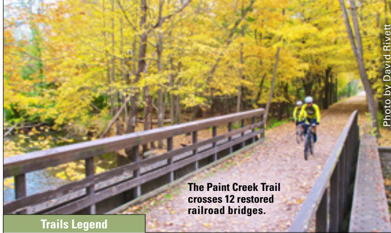
The Paint Creek Trail crosses 12 restored railroad bridges.

The 16.9-mile Polly Ann Trail takes you on a ride through rural northern Oakland County from Orion Township Park to the Lapeer County line. The trail was built on the abandoned Pontiac, Oxford & Northern Railroad that originally ran from Pontiac to Caseville. The trail's name comes from the dubious nickname for