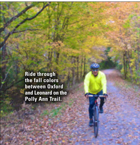
Ride through the fall colors between Oxford and Leonard on the Polly Ann Trail.