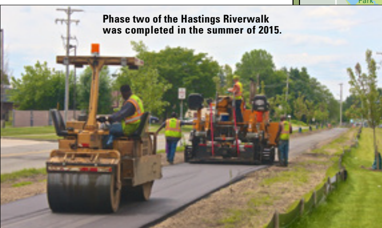
Phase two of the Hastings Riverwalk was completed in the summer of 2015.

Another scenic section of the Paul Henry-Thornapple Trail, the first 1.6 miles of the Hastings Riverwalk was completed in 2011 from Tyden Park to Bliss Riverfront Park with circular loops at either ends. The paved multi-use trail is part of a proposed network of paths and nature trails to be developed along the Thornapple River by the city of Hastings. Phase two of the project was completed in the summer of 2015, extending the Riverwalk 0.8 miles from the footbridge in Tyden Park to the former railbed on Industrial Park Drive, including a new trailhead on Apple Street. Hastings is a popular destination for paddlesports, as well. You'll find bicycle and kayak rentals, lodging and several good places to eat in Hastings.