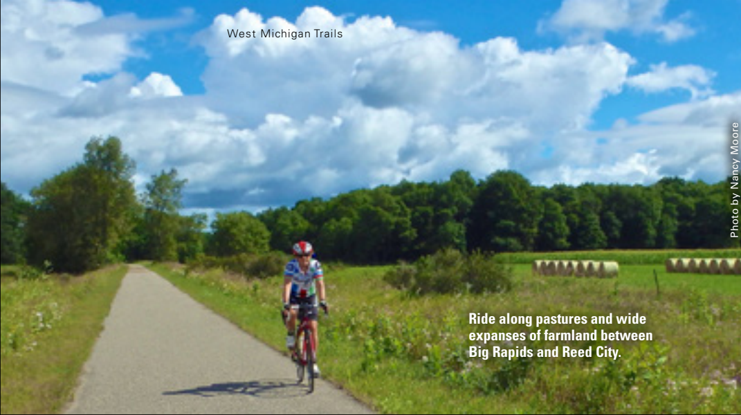
Ride along pastures and wide expanses of farmland between Big Rapids and Reed City.