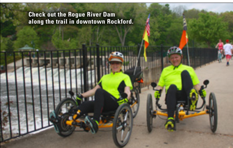
Check out the Rogue River Dam along the trail in downtown Rockford.

The entire length of the White Pine Trail runs parallel to US-131, offering easy access to several staging areas along the course of the trail. And because the trail was built on an abandoned railroad bed, the grade is never steep and well suited for people of all ages and athletic abilities. Each section of the trail has its own natural features and unique personality, and in the following pages we will introduce you to each section of this magnificent trail.