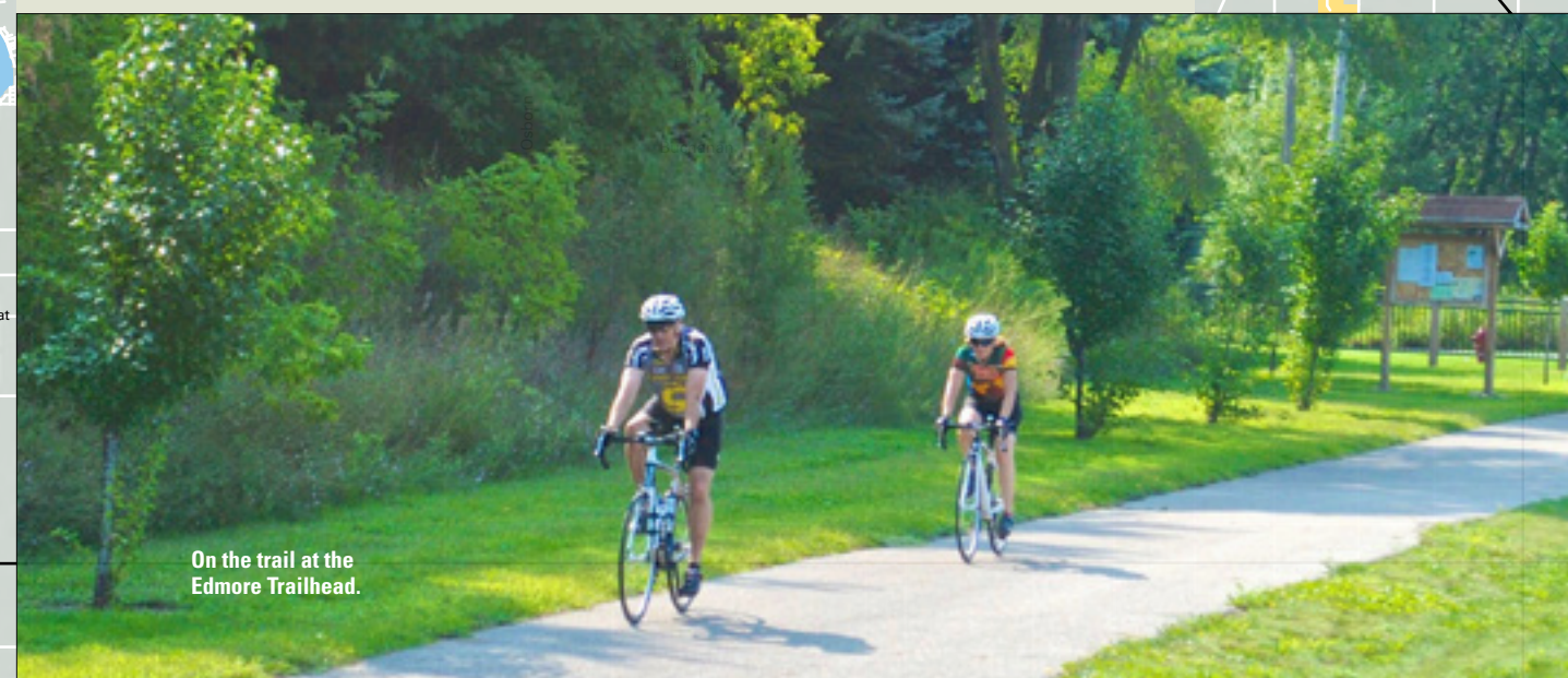
On the trail at the Edmore Trailhead.