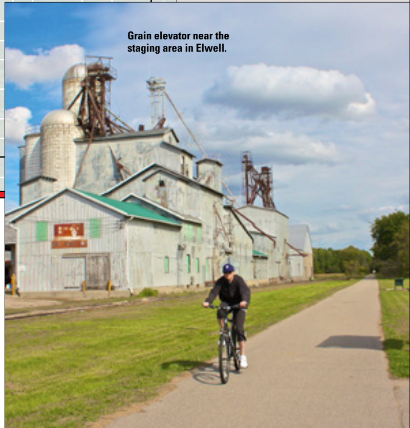
Grain elevator near the staging area in Elwell.