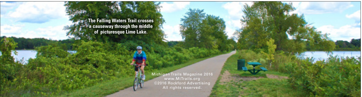
The Falling Waters Trail crosses a causeway through the middle of picturesque Lime Lake.

Dedicated in 2010, The Grand River ArtsWalk is a 1.5-mile multi-use trail that travels through Jackson’s growing arts and entertainment district. It’s also an important link in a long-range plan to build a continuous bike trail from South Haven to Port Huron. The current trail route begins where Cooper Street meets the Grand River. From there, continue west on Michigan Avenue and go north on Mechanic Street through the Armory Art Village (historic site of former state prison). Follow the paved path north along the banks of the Grand River.