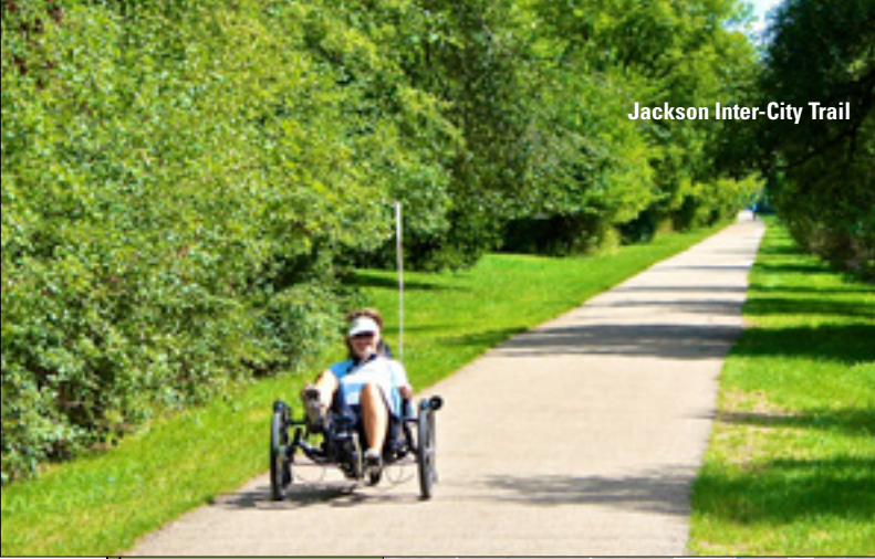
Jackson Inter-City Trail